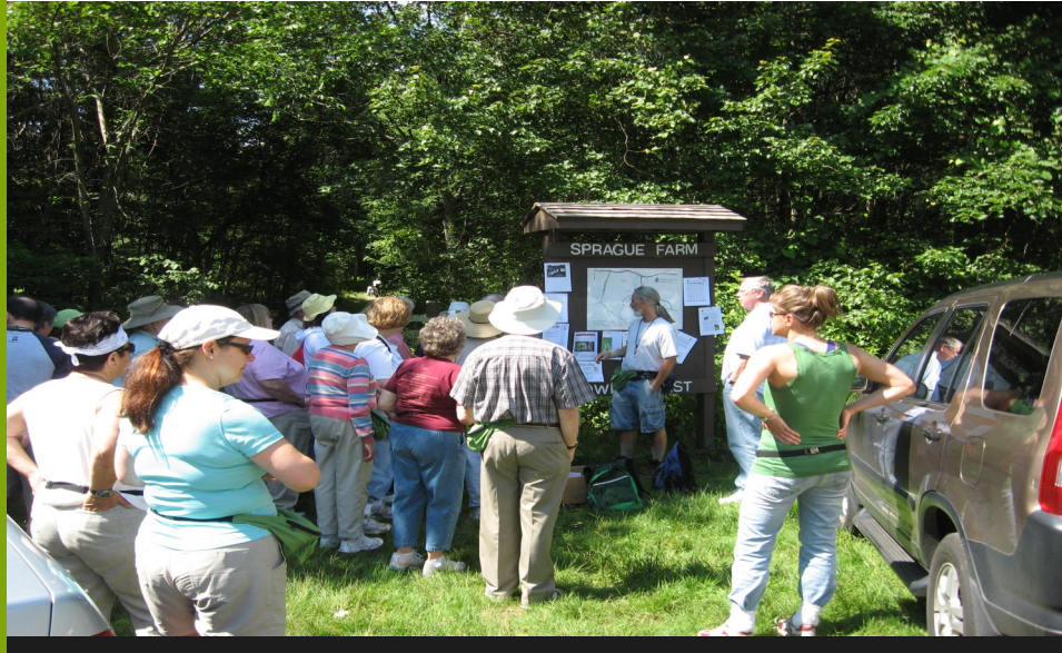
Sprague Farm Town Forest Tour

The trustees of the Glocester Land Trust established four short-term goals that will be completed within a two-year timeframe as well as three long-term goals that will entail defined actions of time that are greater than two years.